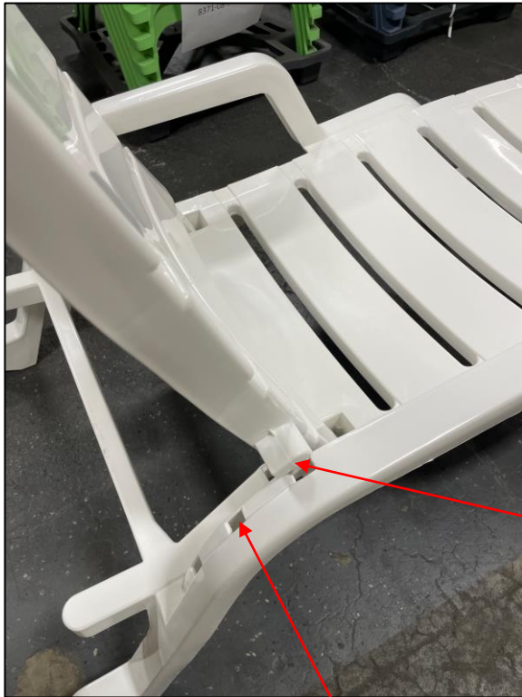
One of four back angle adjustment slots

Step Four: push down to set the pin into the back angle adjustment slot. Make sure the pin is fully recessed.